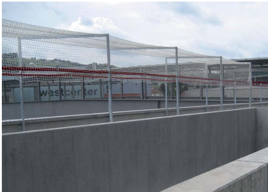
Stationary FENCEBOX® roof for visiting team fans: protects against thrown objects and prevents throwing of objects.