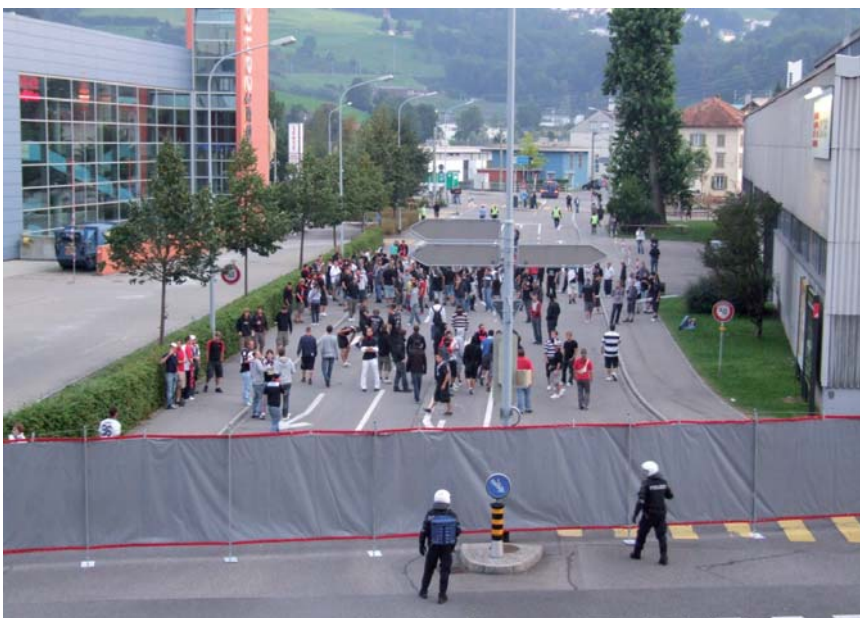
The last visiting team fans make their way to the Winkeln railway station.