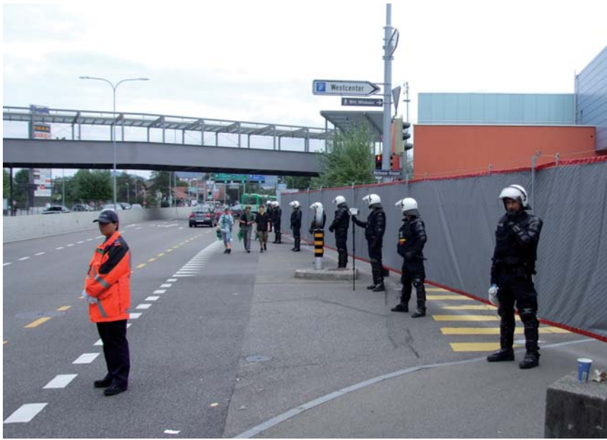
Police in riot gear stand ready for action.