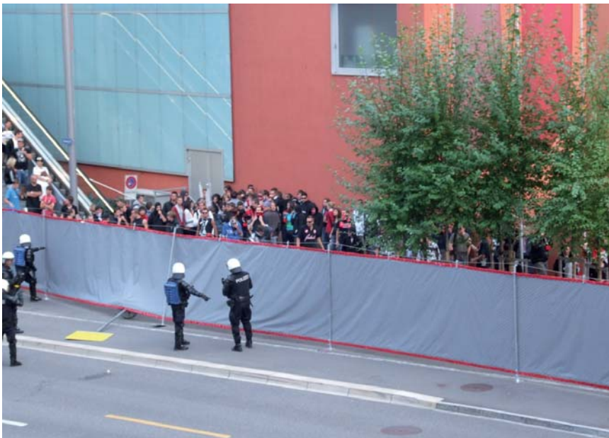
The rollaway fence is standing up to the attack.