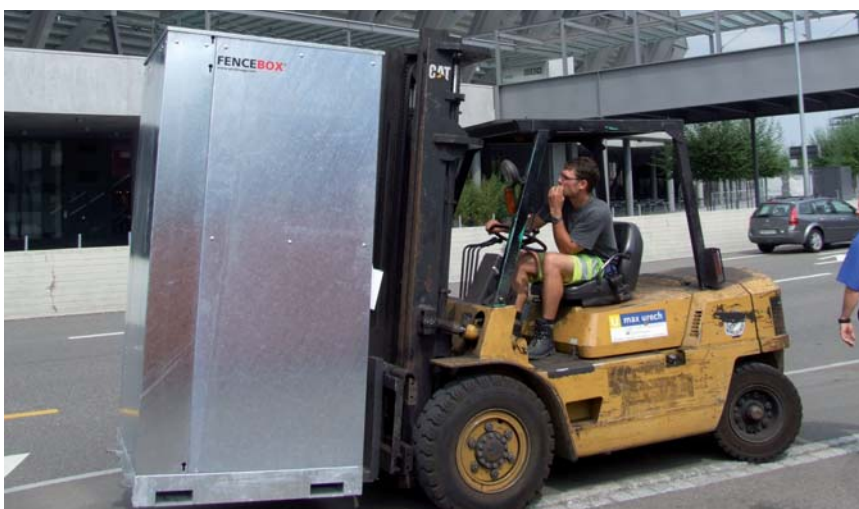
...and placed in position with the forklift truck