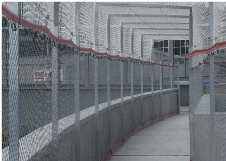
Visiting team fans after the game, on the way home in the stationary FENCEBOX® passage with roof protection.