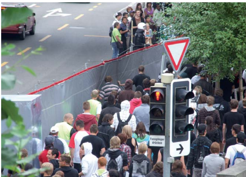
Visiting team fans on the march, with curious St. Gallen fans behind the sight-screen.