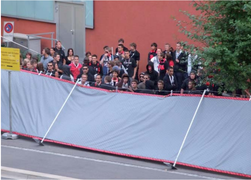
Vandals attempt to storm the rollaway fence with sight-screen.