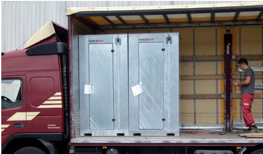
Mobile FENCEBOX® rollaway fences are unloaded ...